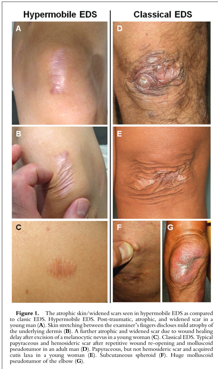
Figure 1. The atrophic skin/widened scars seen in hypermobile EDS as compared to classic EDS. Hypermobile EDS. Post-traumatic, atrophic, and widened scar in a young man (A). Skin stretching between the examiner's fingers discloses mild atrophy of the underlying dermis (B). A further atrophic and widened scar due to wound healing delay after excision of a melanocytic nevus in a young woman (C). Classical EDS. Typical papyraceous and hemosideric scar after repetitive wound re-opening and molluscoid pseudotumor in an adult man (D). Papyraceous, but not hemosideric scar and acquired cutis laxa in a young woman (E). Subcutaneous spheroid (F). Huge molluscoid pseudotumor of the elbow (G).

More than 90% of cEDS patients harbor a heterozygous mutation in one of the genes encoding type V collagen (COL5A1 and COL5A2).